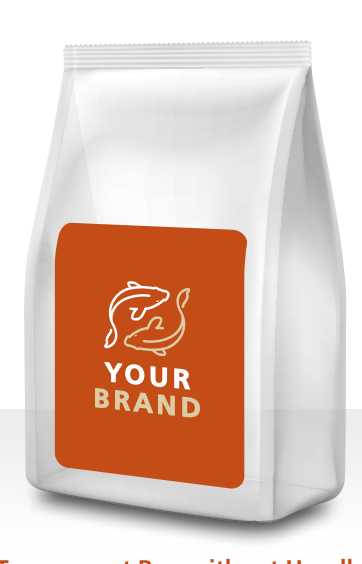
Transparent Bag without Handle: Available in 40 liters.