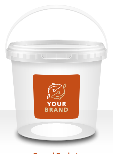
Round Bucket: Available in 3, 5, and 10 liters.