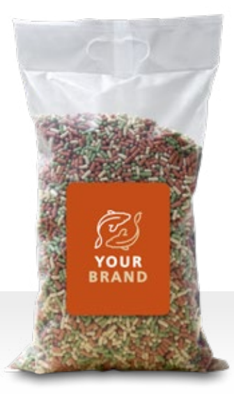
Transparent Bag with Handle: