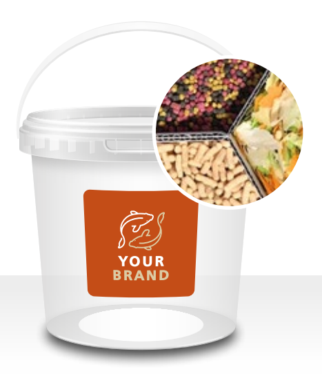
Round Mix Bucket: