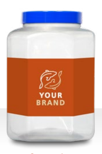
Octagon Jar: Available in 2 and 5 liters.