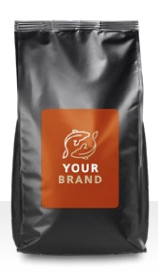
Black Bag: Available in 15 and 40 liters.