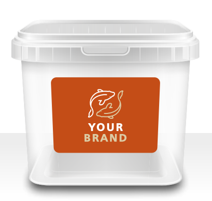
Square Bucket: Available in 1.1, 3.5, 5.4 and 10 liters.